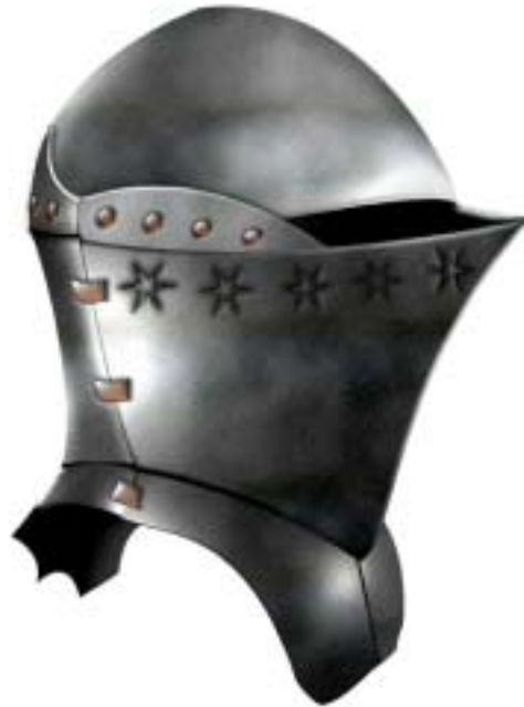
Frederic SIMONS 2001