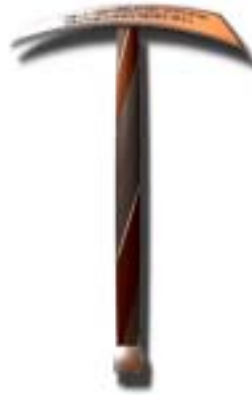
Frederic SIMONS 2001