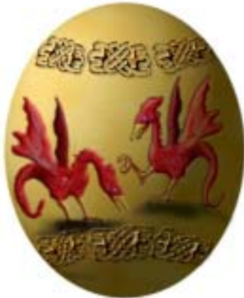
Frederic SIMONS 2001