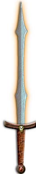
Frederic SIMONS 2001

Cost to Create: 16,125gp, 1,290xp Market Value: 32,350gp Submitted By: COPYRIGHT 2001 Micah J. Higgins Submission Member ID Number: 035