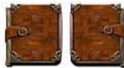
Frederic SIMONS 2001