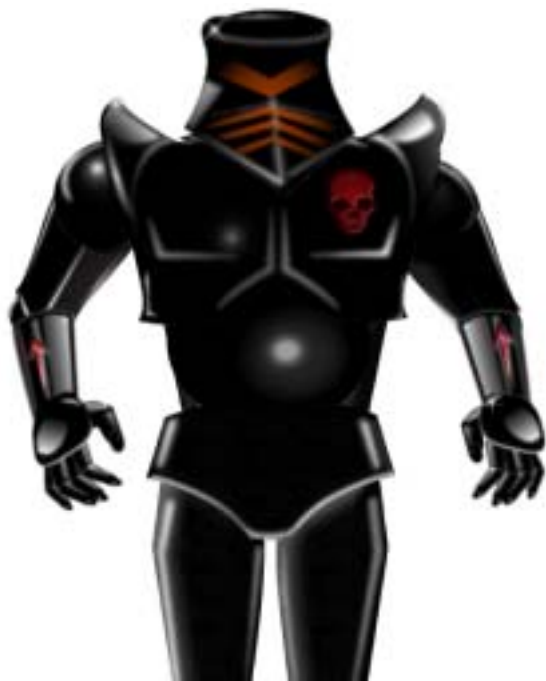
Frederic SIMONS 2001