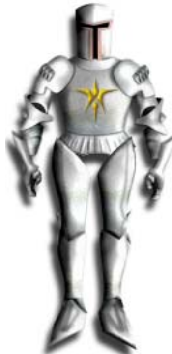
Frederic SIMONS 2001