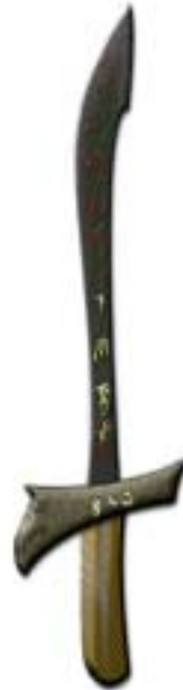
Frederic SIMONS 2001

Market Value: +2 Submitted By: COPYRIGHT 2001 Micah J. Higgins Submission Member ID Number: 035