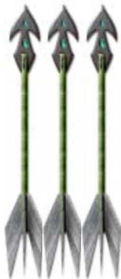
Frederic SIMONS 2001